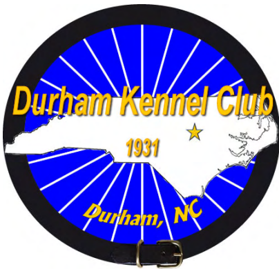
Proposed Logo #1