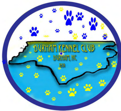
Proposed Logo #2