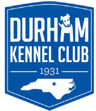
Proposed Logo #3