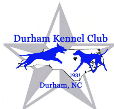
Proposed Logo #5