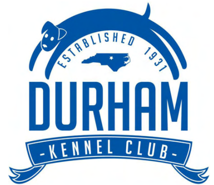
Proposed Logo #6